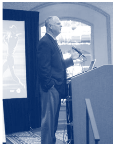
The audience was riveted during the inspirational luncheon speech by Jim "The Rookie" Morris