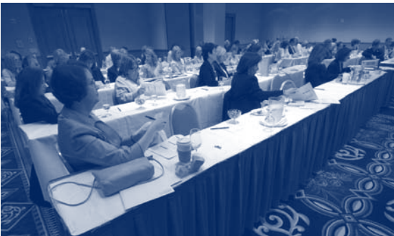
During IECA's annual business meeting, Professional members voted on the new slate of officers