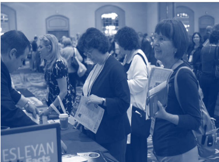
School and College Fair