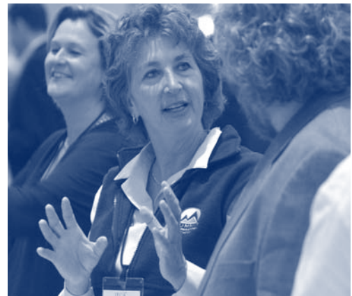
Consultants met with therapeutic programs at the Saturday Swap