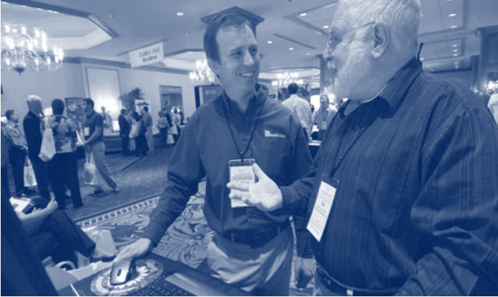
The exhibit hall was full of activity throughout the conference as attendees visited with vendors